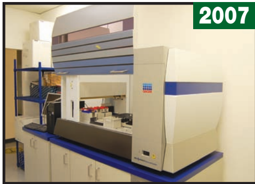
2007 QIAGEN 9016754 Bio Robot Universal