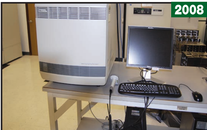
QIAGEN 9016754 Bio Robot Universal