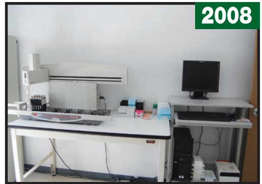
2008 1 OF 2 BIOMEK 3000 Auto Workstations