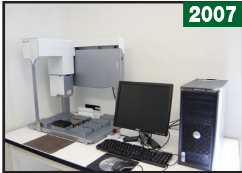
2007 BRAVO Auto Liquid Handler