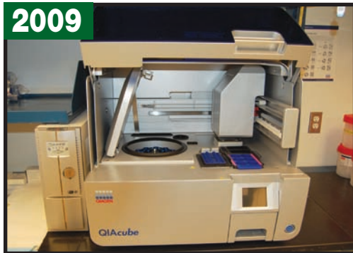
2009 QIACUBE Sample Prep Systems