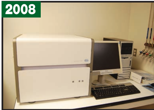
2008 ROCHE 480 Light Cycler