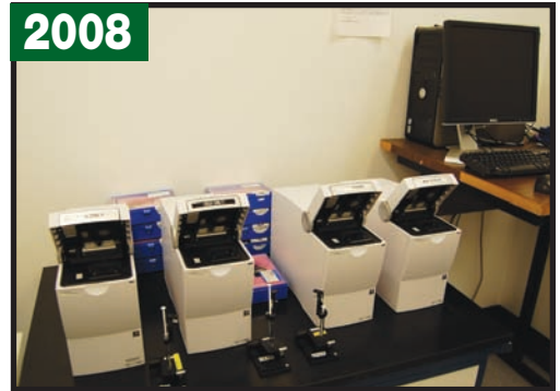
2008 (4) AGILENT Bio Analyzers