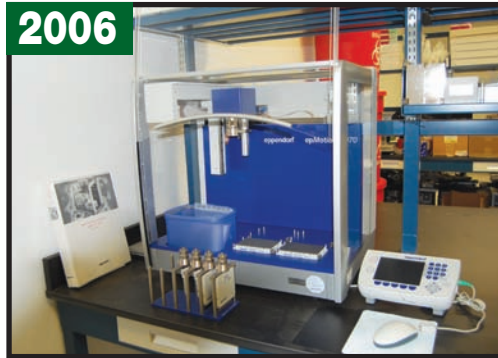
2006 EPPENDORF EP MOTION Liquid Handler