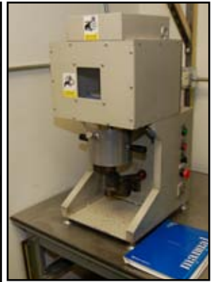
MIYAZAKI MHS-100 MIXER