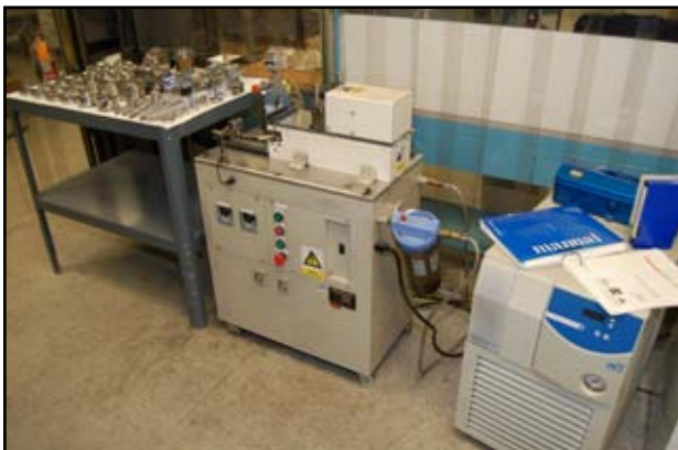
MIYAZAKI FM-P20 EXTRUDER