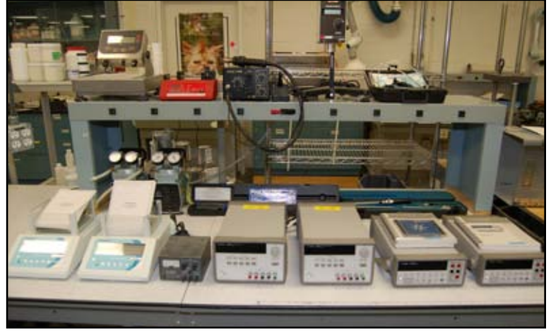
VIEW OF TEST EQUIPMENT