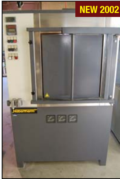
NABERTHERM HT160/17 FURNACE