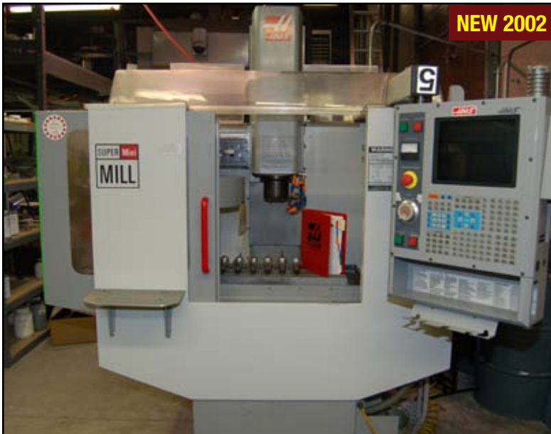
HAAS S MINI MILL CNC MILL

188 NEEDHAM STREET • NEWTON, MA 02464 TEL 617.964.1886 • FAX 617.964.7827 • WWW.JOSEPHFINN.COM