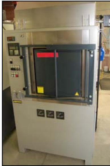
NABERTHERM HT64/17 FURNACE