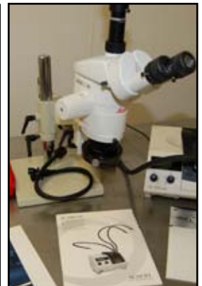
LEICA M295 MICROSCOPE