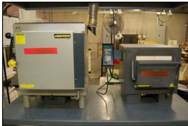
NABERTHERM LH30/14 & N11/H FURNACE